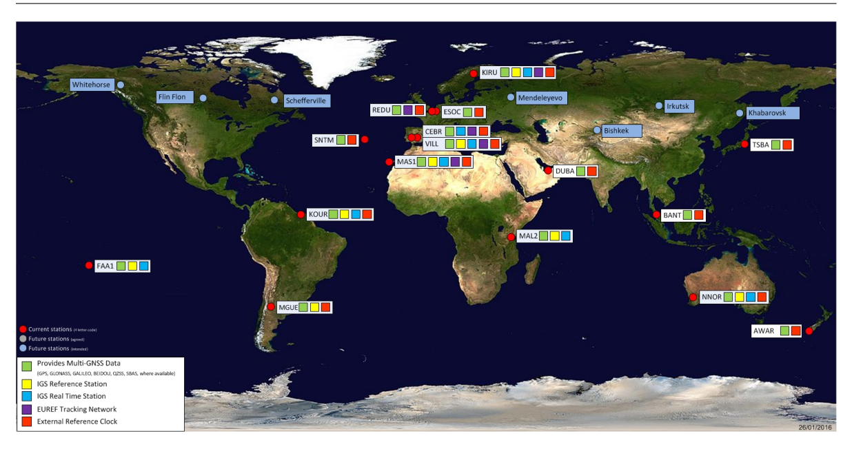
Fig. 1 ESA's GNSS Sensor Station Network operated by the Navigation Support Office.

shown in Figure 1. Several new sites are currently under implementation.